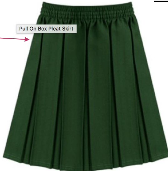
Pull On Box Pleat Skirt

THIS ' FULL BOX PLEATED ' STYLE SKIRT IS THE ONLY STYLE SKIRT THAT IS ALLOWED!!!